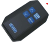
IR remote controller SIR-15

Remote controller is not a part of the device and is available on request.